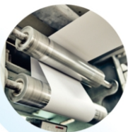
Paper & Pulp