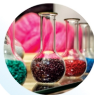
Dyes & Pigment