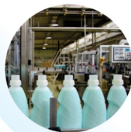
Soap & Detergents