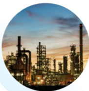
Oil & Refinery